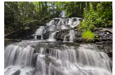
Trahyta Falls in Vogel State Park