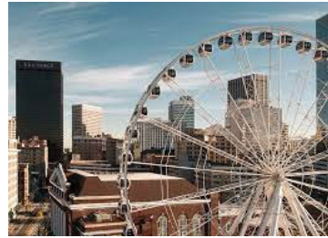
Skyview near Centennial Olympic Park